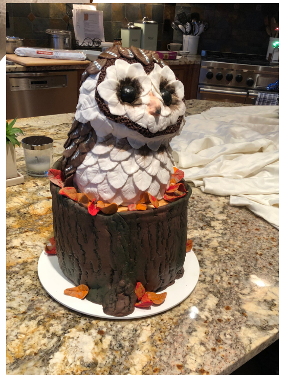
Without question - the cutest cake EVER