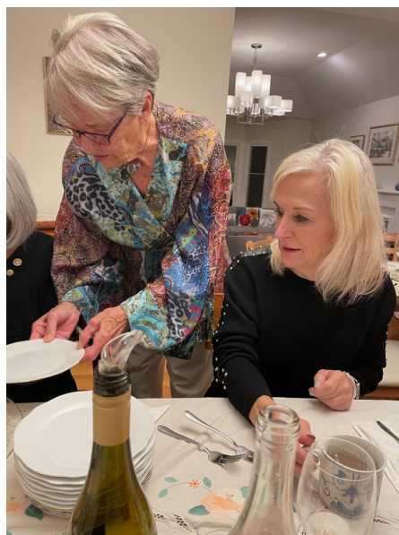
Is there pie under there?